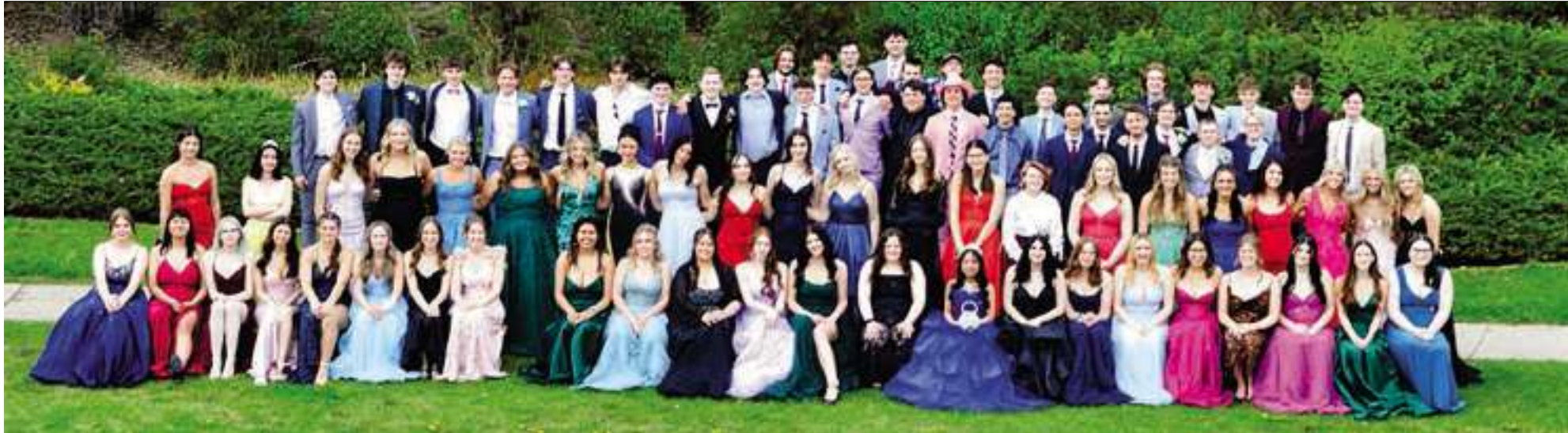
The John Maland High School Class of 2024.